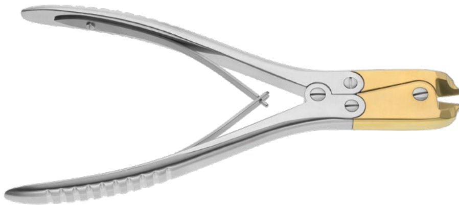
STERNUM Implant Cutter coated — special coated tip